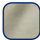
Satin Nickel Plated