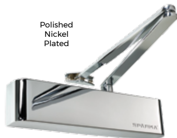
Polished Nickel Plated