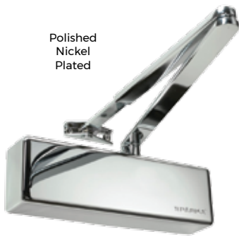
Polished Nickel Plated